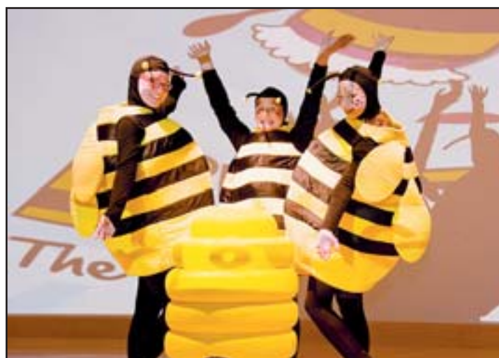
Left: A scene of the 'Buzz: The story of Glory Bee' production which will be staged in Kuwait during the opening of Bayt Abdullah hospice. Right: a scene of 'The Dream Dealer' which was staged earlier in Kuwait.

out logo at the Edinburgh Festival and has been performed in schools all around the world including Japan and